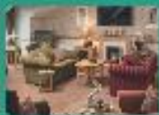
Lavender Court Taunton TA1 2BD