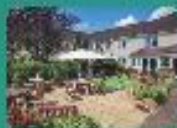
Calway House Taunton TA1 3EQ

Whether you need residential care, nursing care, specialist dementia care or simply a little extra help with daily tasks, we offer all the support you need to live the life you choose.