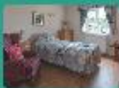
Meethaven Taunton TA1 2JT